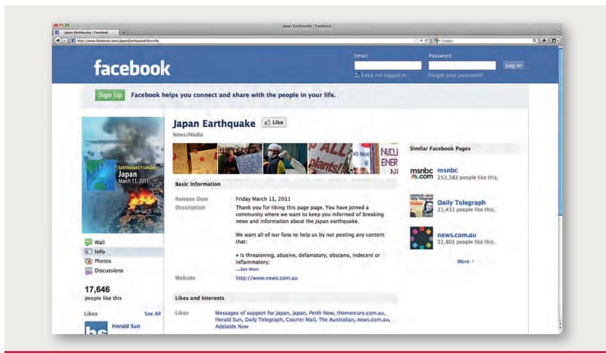
Social media such as Facebook and Twitter have been used extensively by emergency service agencies.

A major weakness of engagement and education activities and programs delivered by Australian emergency agencies is lack of evaluation. The National Review of Community Education, Awareness and