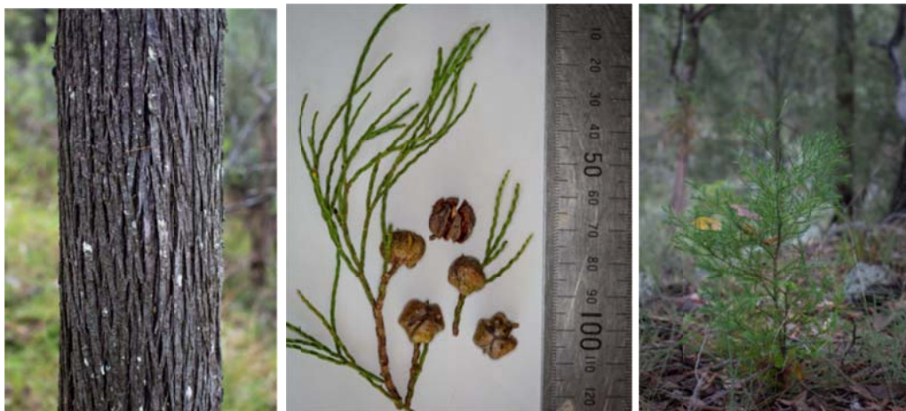
Mature trunk Callitris baileyi, Callitris baileyi cones, Callitris baileyi juvenile

Kyogle Council and the NSW Government need your help to save the endangered Bailey's Cypress Pine ( Callitris baileyi ).