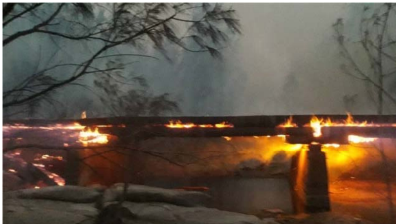
Low level timber beam bridge with concrete deck burns at Wytaliba, about 50 km east of Glen Innes

The authors are currently collecting data on bridges lost on the east coast of NSW during the last fire season (September 2019 to January 2020). Many more timber bridges succumbed on the South Coast of NSW during January, which have yet to be catalogued and analysed. Current indications are that up to 50 timber bridges could have been destroyed on public roads in NSW, with more in State Forests and National Parks. Whilst much of the remediation work will be funded by NSW State Government bushfire recovery funds, it is nevertheless a significant drain on the public purse and poses a major disruption to regional transport networks.