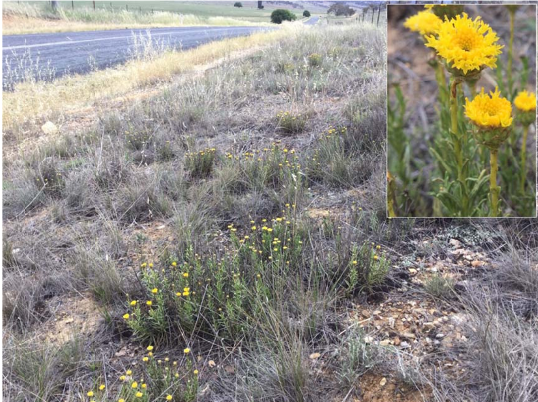
The endangered button wrinklewort growing in narrow road reserve (inset: flower)