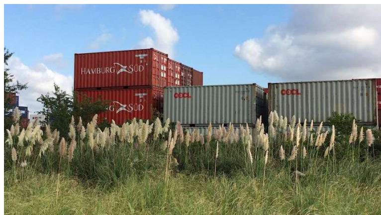
Pampas grass located close to rail lines (source: Invasive Species Council)

Source: ABC News 28 May 2021 https://www.abc.net.au/news/2021-05-28/invasive-weed-travels-west/100164650