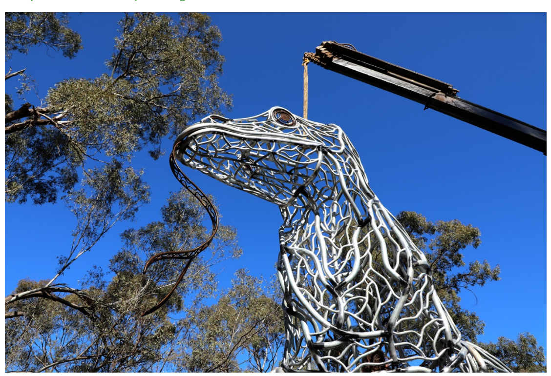
Installation of Goanna named Varanus (Gugaa) crafted by northern NSW sculptor Glen Star (source: Forbes Shire Council)

More details at <a href="https://www.forbes.nsw.gov.au/news/july-2020/lachlan-valley-sculpture-trail-is-expanding">https://www.forbes.nsw.gov.au/news/july-2020/lachlan-valley-sculpture-trail-is-expanding</a>