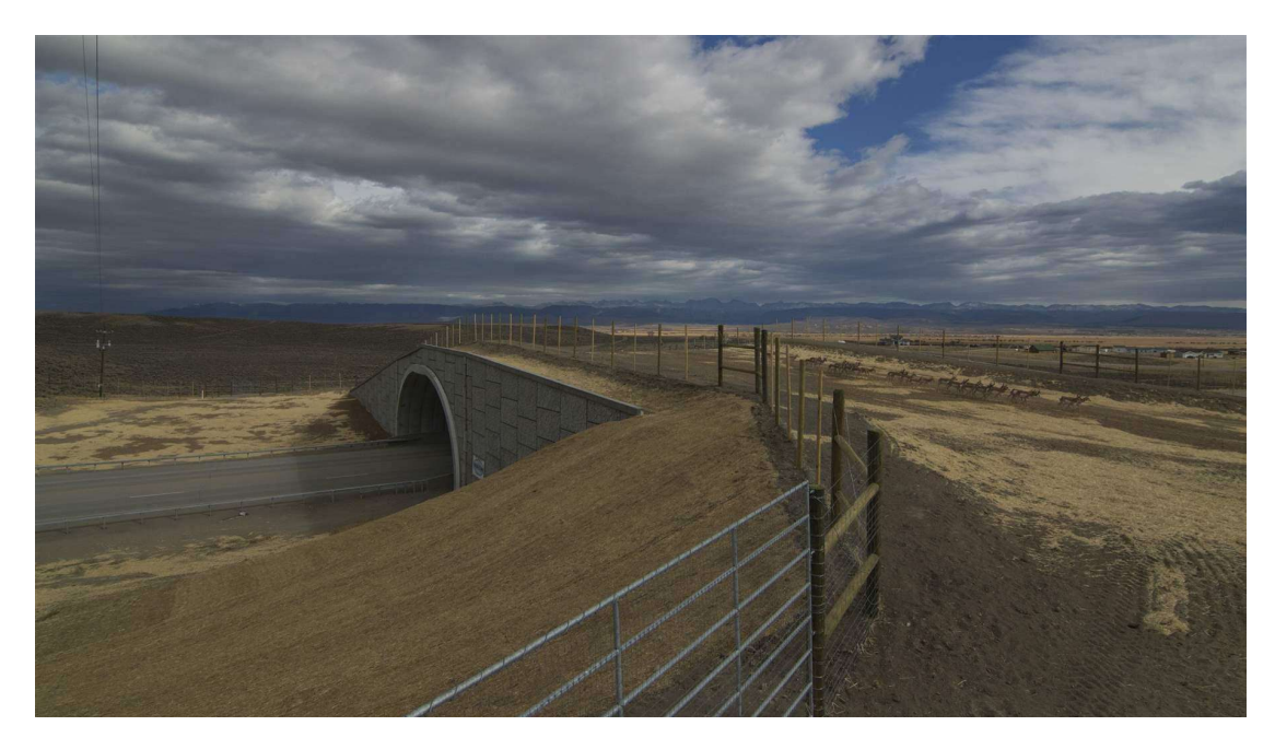
Wildlife bridge at Trappers Point, USA

According to a recent article published by the Pew Trusts, in the USA about 26,000 people are injured by wildlife-vehicle collisions every year, costing Americans more than $8 billion in vehicle repair, medical costs, towing, and other expenses. The average cost of a vehicle colliding with a moose exceeds $44,000 in 2018 dollars.