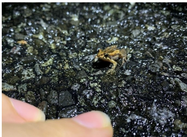
> Mahony's Toadlet

In 2016, a newly discovered amphibian species, Mahony's Toadlet ( Uperoleia mahonyi ), was identified in the Port Stephens area and was listed as a threatened species the following year. To address the potential impacts of the council's maintenance program on the species, ecological surveys were conducted of roadside environments to assess for likely habitat of Mahony's Toadlet to include in the council's Environmental Management System. The council took the opportunity to integrate this project into the existing Hunter Joint Organisation Regional Roadside Environment Marker Scheme, creating a new roadside marker category for amphibians that can be used by other road authorities across the Hunter Region.